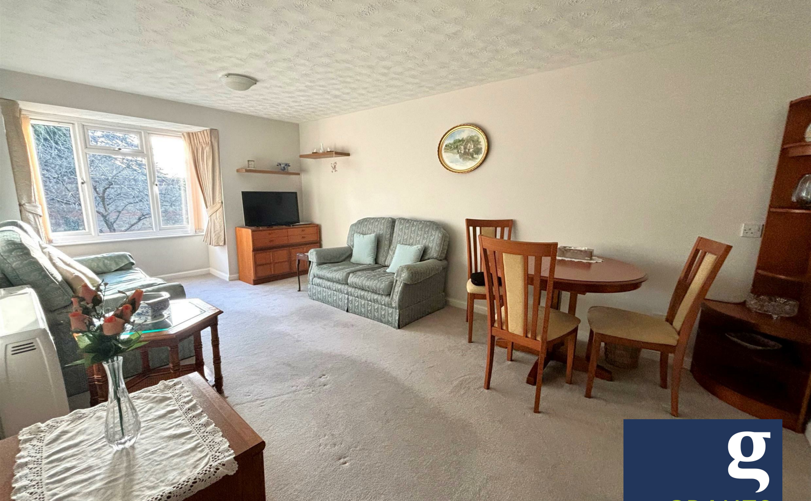
Crockford Park Road, Addlestone, KT15 2LQ